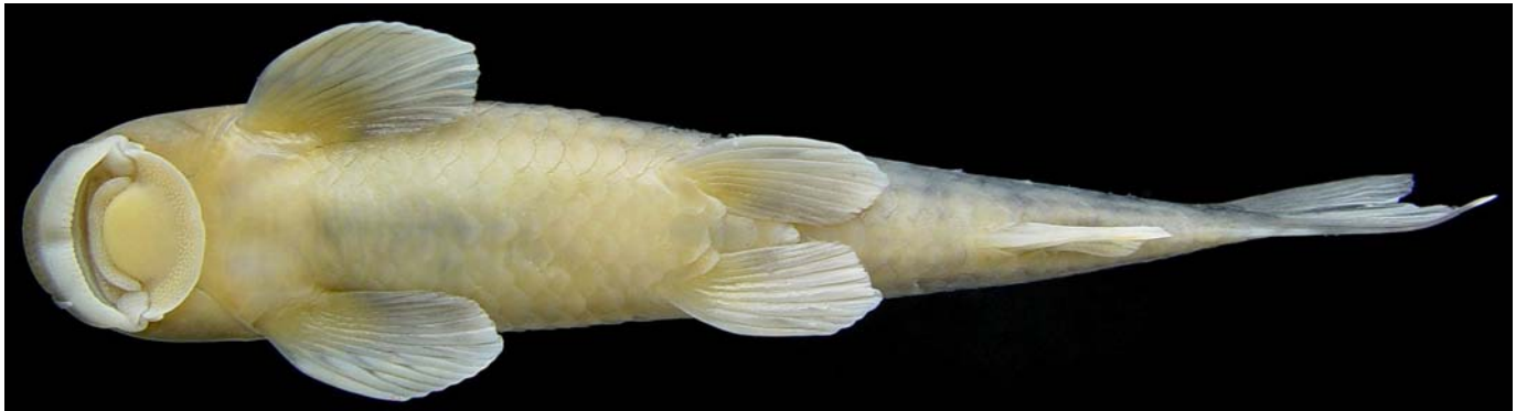
Image 2. Garra arupi sp. nov. Ventral view of holotype RGUMF-0184