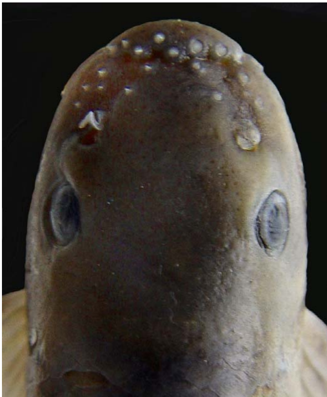
Image 3. Garra arupi sp. nov. Dorsal view of head of holotype RGUMF-0184