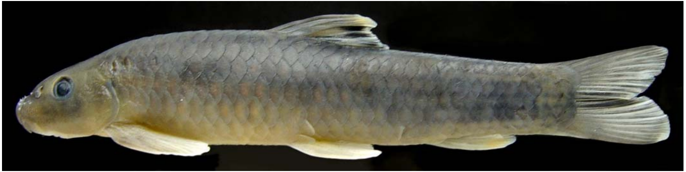
Image 1. Garra arupi sp. nov. Lateral view of holotype RGUMF-0184