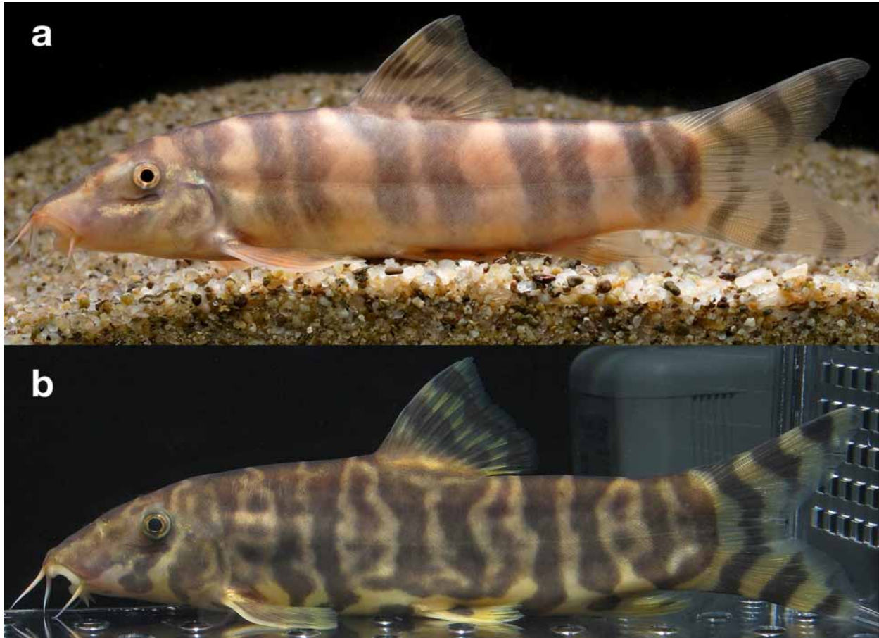
FIGURE 3. Live coloration of Botia udomritthiruji : a. ZRC 50984, paratype, 84.6 mm SL (photograph by H.W. Choy); b. aquarium specimen ca. 105 mm SL (not preserved; photograph by B.K.Y. Lee).

Botia to seven species from South and Southeast Asia diagnosed by the following characters: mental lobe developed into a barbel; fronto-parietal fontanelle narrow; anterior chamber of gas bladder almost entirely covered by bony capsule, posterior chamber large or reduced; anterior process of premaxilla entire, not surrounding a cavity, rostral process long, with distinct ridge along inner edge; top of supraethmoid narrow or broad, optic foramen very small; suborbital spine bifid and not strongly recurved; head naked. Although it was not possible to examine all of the osteological characters used above to diagnose Botia , B. udomritthiruji possesses a mental lobe developed into a barbel and a suborbital spine that is bifid and not strongly recurved. On the basis of these characters, the new species is assigned to Botia (sensu Kottelat).