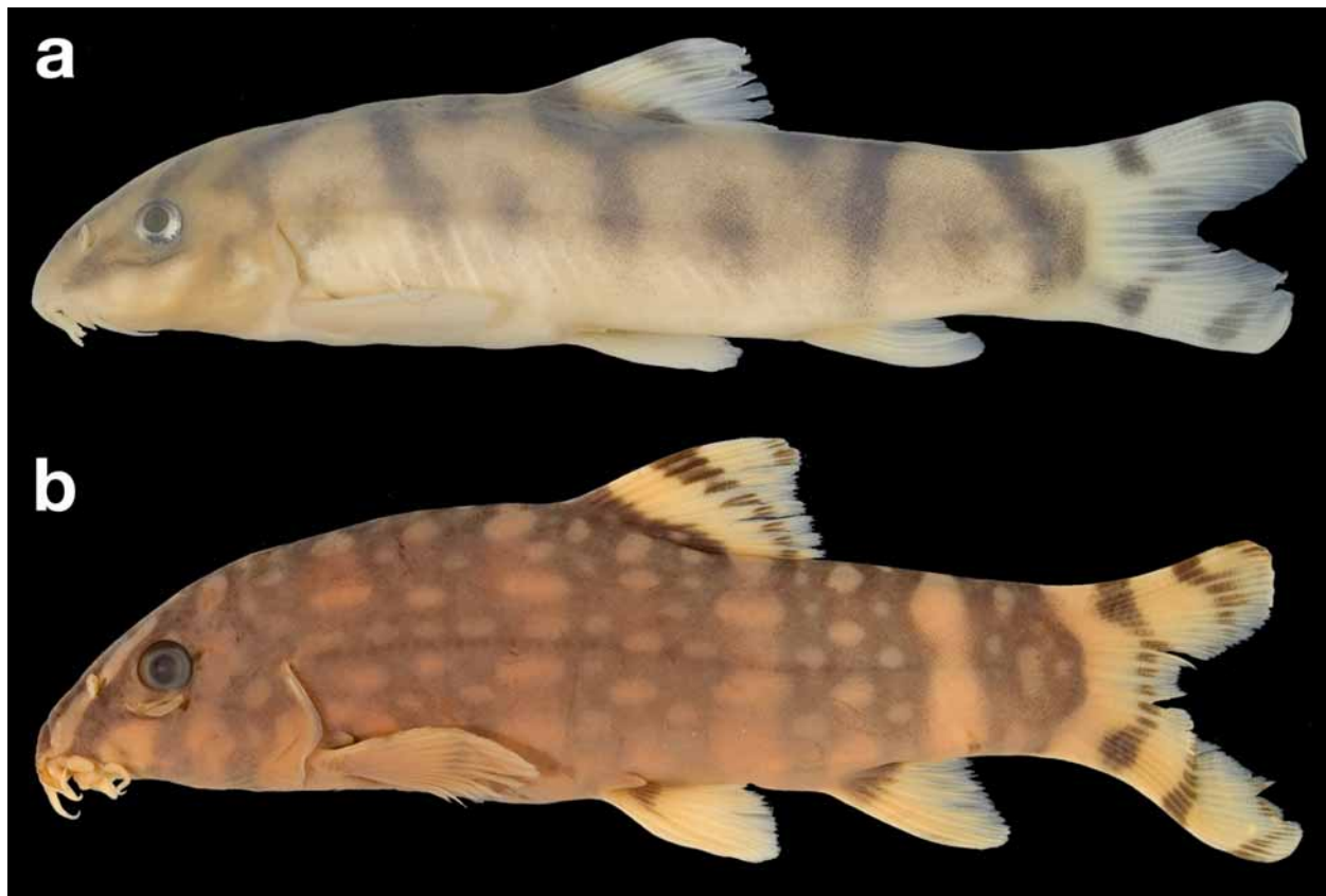
FIGURE 5. Lateral views of: a. Botia almorhae , UMMZ 244844, 44.3 mm SL; b. B. rostrata , UMMZ 208800, 42.6 mm SL, showing differences in color pattern and body depth.

barrage in Ambari, 26°35'40.0"N 88°29'48.0"E. UMMZ 244844 (7), 44.3–58.4 mm SL; ZRC 50986 (3), 47.2–50.8 mm SL; India: West Bengal, Tista River at Tista barrage, 26°45'1.0"N 88°35'11.0"E.