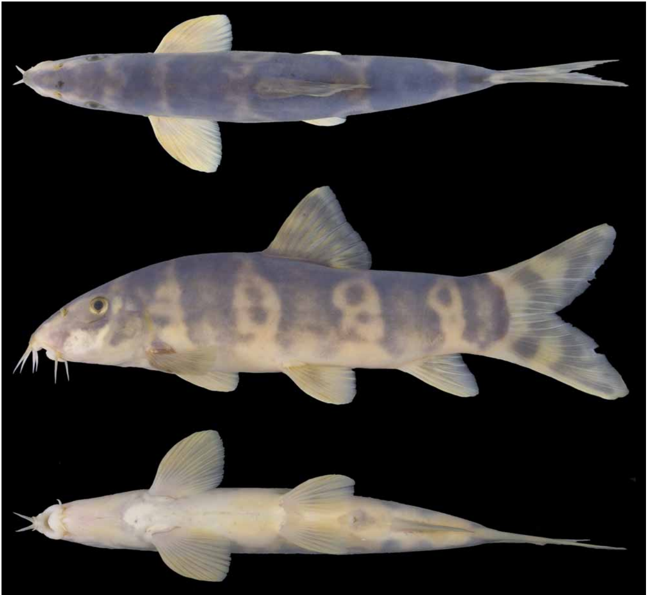
FIGURE 1. Botia udomritthiruji , holotype, UMMZ 248184, 107.0 mm SL; Myanmar: Tenasserim River drainage.

Distribution. Botia udomritthiruji is known only from the Tenasserim River drainage (Fig. 4). This represents the first record of the genus from the Tenasserim River drainage, although its presence there is to be expected given that it has been previously recorded in adjacent river drainages.