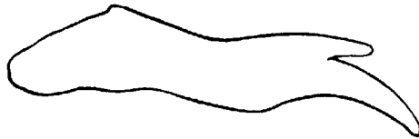
Fig. 2. Suborbital spine of Paralepidocephalus yui .

ral, situated on the anterior half of the head; nostrils in front of eye; an erectile bifid spine below eye; barbels short, six in number, four on snout and two on maxillaries; snout pointed; no scales on head and body; lateral line absent; dorsal origin equidistant from caudal base and gill-opening, at some distance behind base of ventrals; ventral situated about equidistant from tip of snout and caudal base, not reaching the vent; anal origin about equidistant from ventral origin and caudal base; vent in front of anal; pectoral subfalciform, reaching about one-third the distance from its base to ventral origin; caudal truncate.