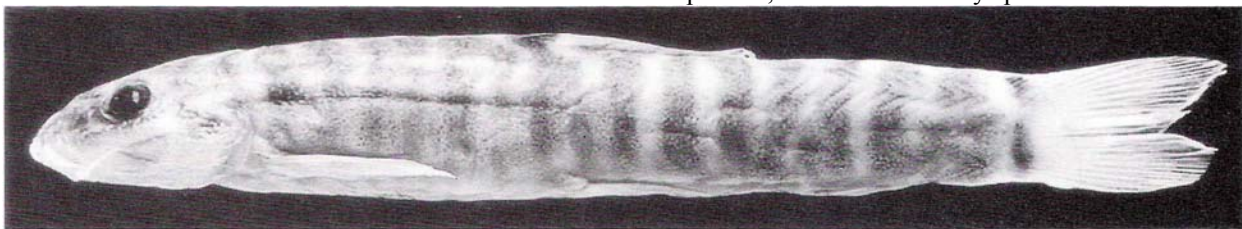
Fig. 1: Schistura minutus sp. Nov.

Description: D. iii, 8½; P. i, 8-9; V. i, 6; A. ii, 5½; C. 9+8. A small moderately elongate nemacheiline with body depth almost uniform from the occiput to the base of the caudal fin. Body moderately deep, with 14-18 lateral bars. Ventral profile almost straight from mouth to caudal base, dorsal region of head is highly curved, straight behind dorsal region. Body cylindrical to slightly compressed anteriorly, more compressed in caudal peduncle region. Cheeks slightly inflated, head slightly depressed, snout moderately pointed. Mouth ventral,